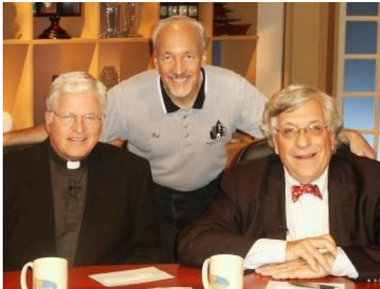
Boks on the nationally syndicated television show The God Squad .